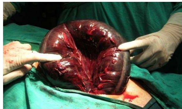
Photo - 2: Gangrenous sigmoid colon and terminal ileum with normal primal bowel loops.

Photo - 1: Intra-operative dilated gangrenous sigmoid colon.