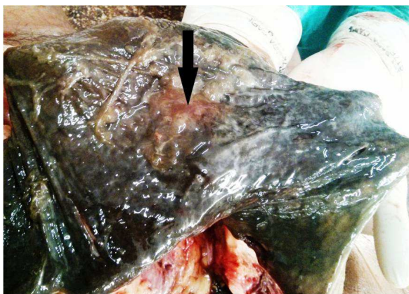
Photo – 1: Hemorrhagic spots on stomach mucosa along with grey discoloration.

While post mortem examination of this body was going on, our colleagues were doing another post mortem examination of a decomposed body in same examination room. As the decomposed body had been invaded with