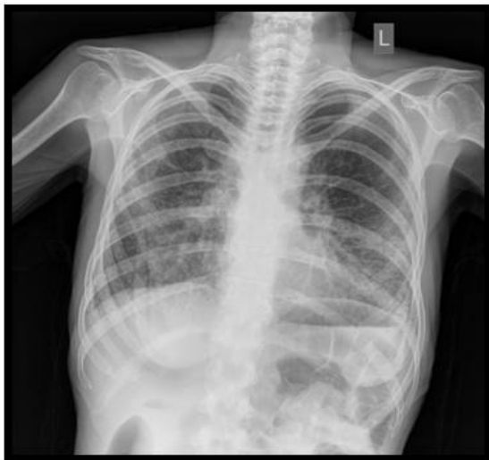
Figure – 1A, 1B: X - ray shows reticular thickening in the lower zones. HRCT shows reticular thickening with ground glass opacities and sub pleural sparing of lung.

observed in 89% of the cases ( Figure – 1A, 1B ). However HRCT managed to detect reticular opacities in 98% of the cases, thereby implying a much greater sensitivity in the identification of these densities. Furthermore, in the detection of these reticular opacities, although conventional chest radiography was able to differentiate between medium and coarse opacities, their detection of fine reticular densities was a cause of concern. HRCT detected fine reticular opacities in the lungs when the chest radiograph revealed no such abnormalities.