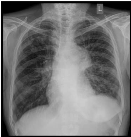
Figure – 4A, 4B: X - ray shows mastectomy on left side with left hilar mass and reticular thickening in left upper and mid zone. CT scan shows a left hilar mass with septal thickening as shown suggestive of lymphatic spread of tumor.

are limited, UIP pattern appears to predict worse survival in RA-ILD patients. Larger, prospective, multicenter studies are needed to confirm this finding. We propose that the evaluation of patients with RA-ILD should focus on identifying those with UIP pattern on HRCT scans, as these patients are likely to carry a worse prognosis. In patients in whom the underlying pattern cannot be determined by HRCT scanning, surgical lung biopsy should be considered.