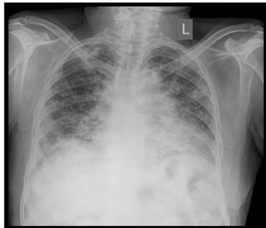
Figure – 2A, 2B: X - ray shows reticular thickening with minimal honeycombing in lower zones. HRCT shows classical sub pleural and peripheral honeycombing.

The end stage of interstitial lung disease is characterized by honeycombing ( Figure – 2A, 2B ). It reflects extensive lung fibrosis with alveolar destruction, thereby resulting in a characteristic reticular appearance. On HRCT, it is associated with gross distortion of lung architecture, where individual lobules are no longer visible. In our study, such honeycombing was seen in 52% of the cases on HRCT while chest radiography could detect them in only 31%. On HRCT, honeycombing was much more accurately diagnosed by the presence of thick walled, air filled cysts, usually measuring 3 mm to 1 cm in diameter, typically occurring in several layers at the pleural surface.