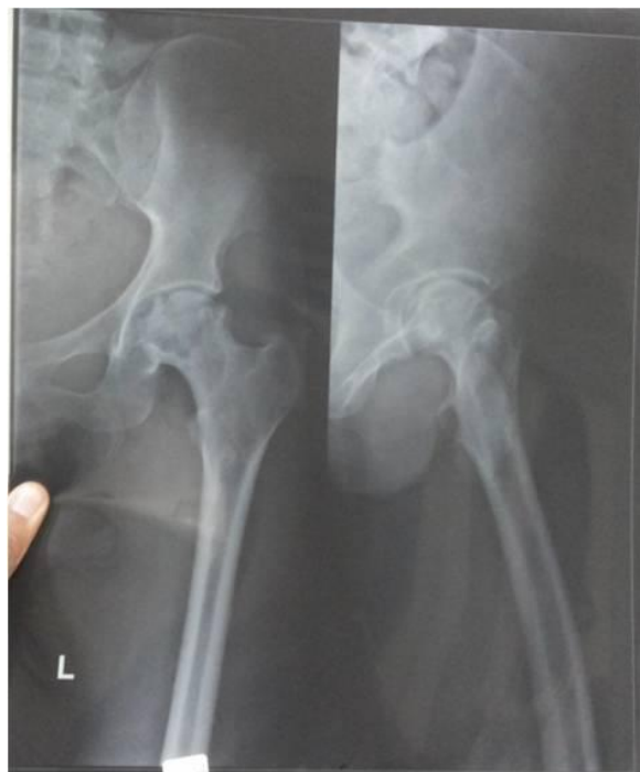
Figure – 1: X-Ray showing avascular necrosis of left femoral head.

His complete blood count revealed anaemia Hb 10.1 gm%, RBC's 5.14 million/cubic mm, MCV 56.1 fl, MCH 19.3, MCHC 34.5, RDW 21.6% with normal total count and platelets with ESR 10 mm/hr. Peripheral smear showed microcytic hypochromic RBC's with moderate anisopoikilocytosis in the form of target cells, elliptocytes, sickle cell, few fragmented RBC'S with polychromatic cells. Reticulocyte count was 4.7%.