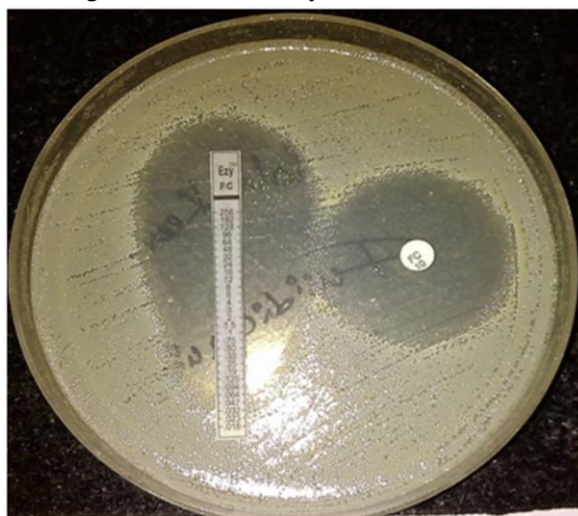
Figure - 4: Fusidic acid E- test strip and Disc showing zone of sensitivity.

The most common diagnosis was found to be furunculosis in 49 (45.8%), followed by impetigo ( Figure - 1, 2 ) and folliculitis each in 18 (16.8%). Lesser incidence of abscess (5.6%), ecthyma (4.6%) and carbuncle (1.9%) were observed ( P = 0.00 ) ( Table - 3 ). Most of the cases of pyoderma involved the lower extremities (30.8%), followed by face (22.4%), neck and trunk (11.2%) ( P = 0.00 ).