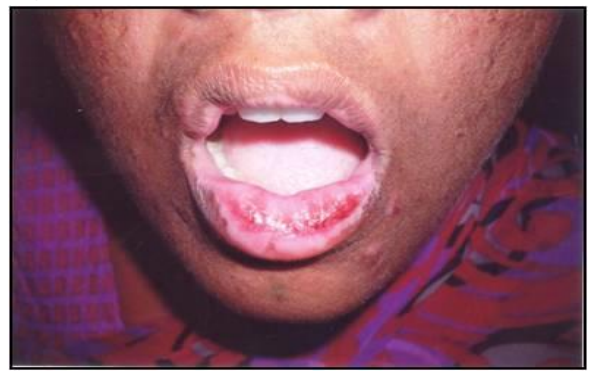
Figure - 2: severe form of PV with erosions, encrustations and ulceration.

Figure - 1 : Mild form of PV with encrustations.