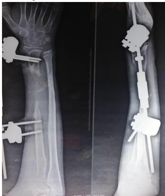
Figure – 2: Post Debridement with Distraction correcting the ulnar variance.

In the second stage the bone ends were freshened, again sample taken for culture and the final gap measured. For radius, opposite approach than in first stage, was used. Non-vascularized fibula was harvested of length 1cm more than the gap, placed in the gap after manually distracting the forearm as much as possible and fixed with intramedullary K wire. After releasing the traction fibula got “press fit” between the parent bone ( Figure - 3, 4 ). Postoperatively antibiotics continued up to 3 weeks more. The limb was immobilized in plaster slab for about 6-8 weeks till radiological evidence of union commencement of fibula at both ends occurred. The child was followed at 6, 12, 24 weeks and then 3 monthly for at least 1 year post operatively. Follow up included union and functional status along with note of any complications.